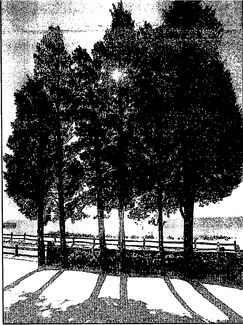
Light, snow and a picturesque community provide the perfect landscape for photographers. Here, a shimmering sun is deceptive to those who are unaware of the true bitter cold that can come with a clear winter sky over Duxbury.